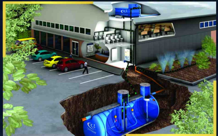
Rain water Harvesting System