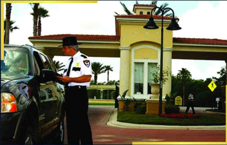
Gated community with 3 Tire security