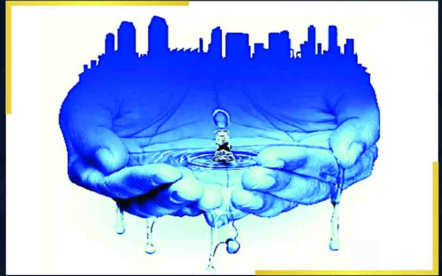
24 Hours Water Facility