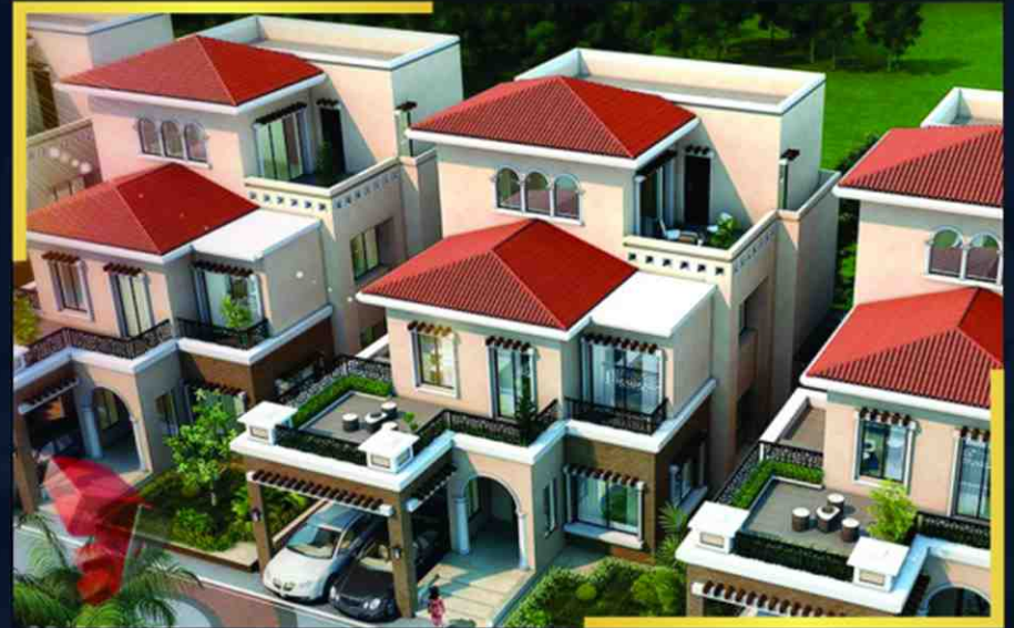
Fully Occupied Colony