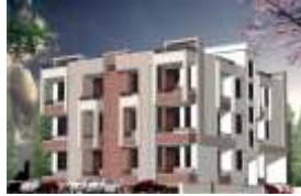
SHRIRATNAM HEIGHTS-1 Ajmer Road, Jaipur