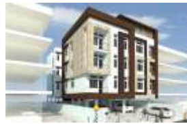
SHRIRATNAM HEIGHTS-2 Ajmer Road, Jaipur