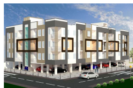
SHRIRATNAM EMERALD Ajmer Road, Jaipur

Disclaimer: Builders & Developers reserve the right to change any design & specification of the building without any prior notice or information. This brochure is for illustration purpose only & cannot in any way to be treated as a legal document.