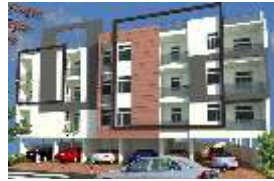
SHRIRATNAM SAPPHIRE Ajmer Road, Jaipur